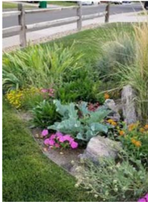
Flower Up. There are lots of water-efficient plants that can replace any grassy areas that aren't needed.

Colorado is a dry climate with limited water supplies. Cottonwood Water encourages water conservation through rebates on water conserving appliances ( www.cottonwoodwater.org/rebates/ ), participation in the Garden in a Box program, tiered water rates, and 3 day a week watering.